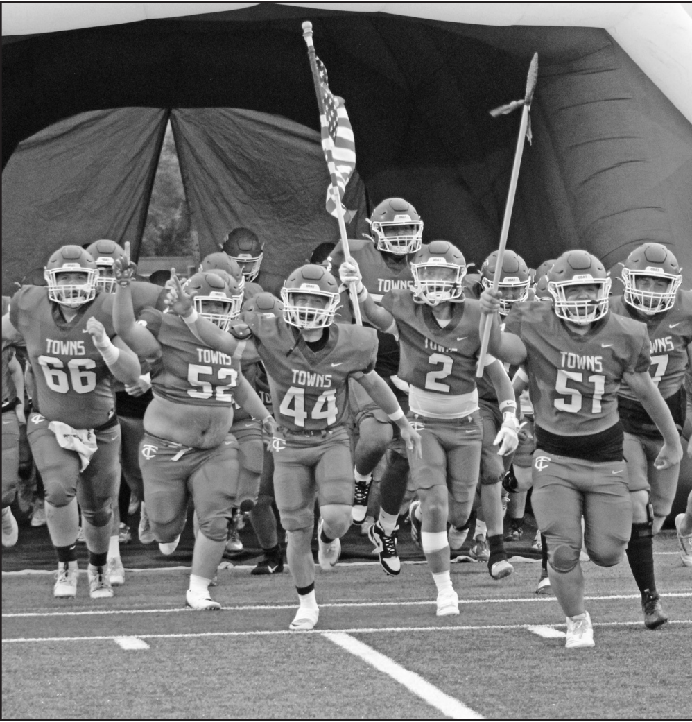
The Indians take the field at home ahead of last Friday night's 47-6 victory over Greenville, South Carolina.

Turnovers you ask? Greenville - 5 and Towns County - 1. With stats