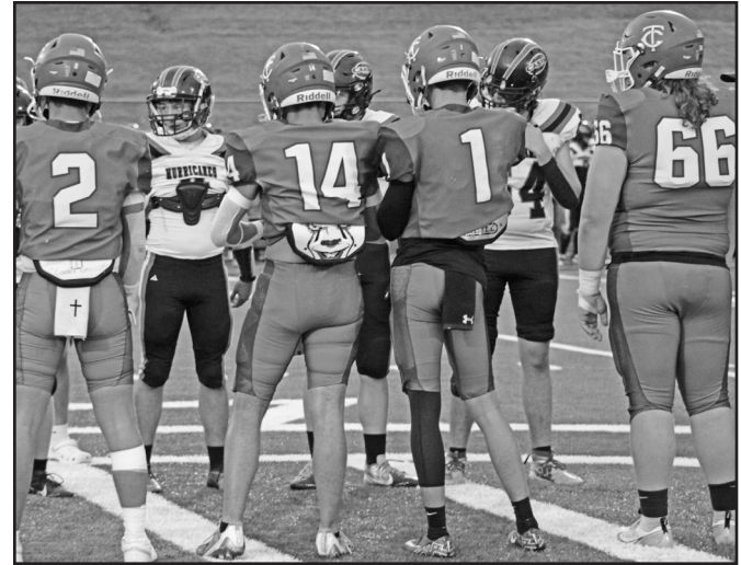
The Indians are off to a 3-1 start and travel to Ware Shoals, SC on Friday night.

mark Towns County's second 0-3 and have been outscored the first five games of 2021. 139-85 in its three losses.